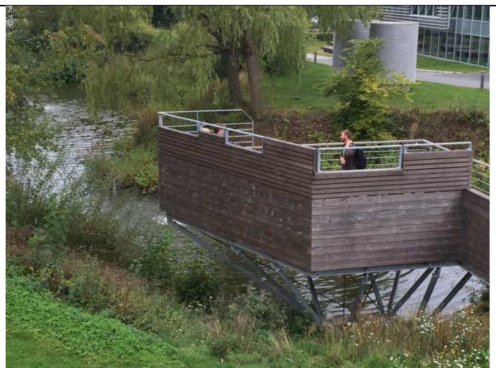
Lundagård from the Dome to Kungshuset