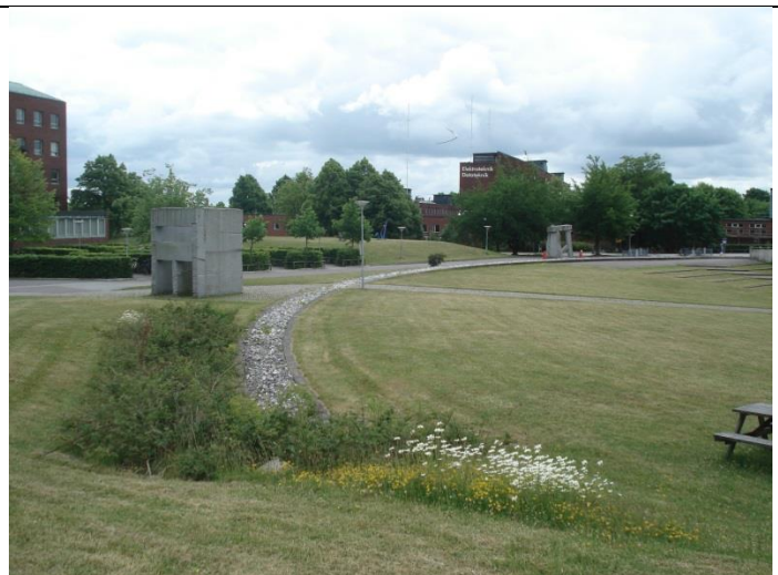
The old library, another world, for thinking