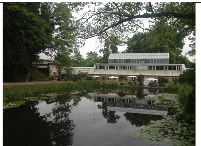
Café in Botanical garden