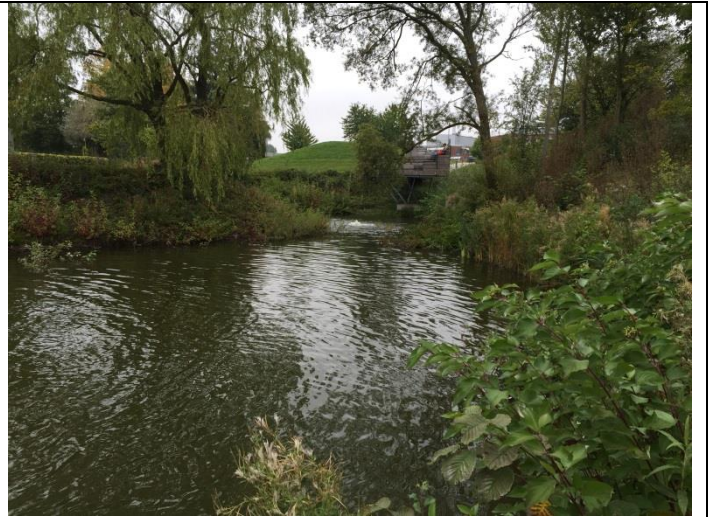
Trail at the LTH lake.