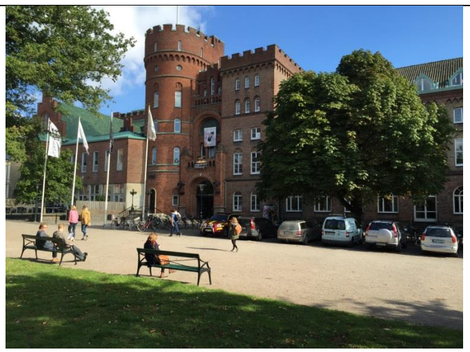
The Lund Festival 2014