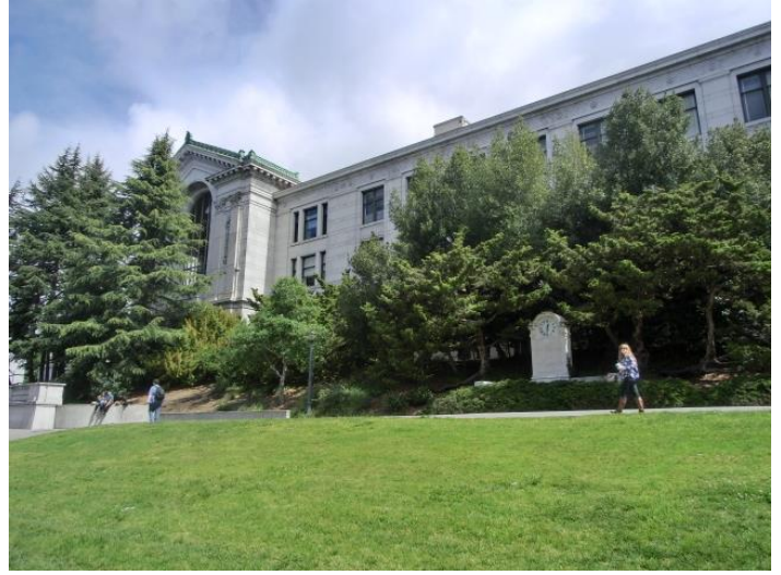
The Library, white granite