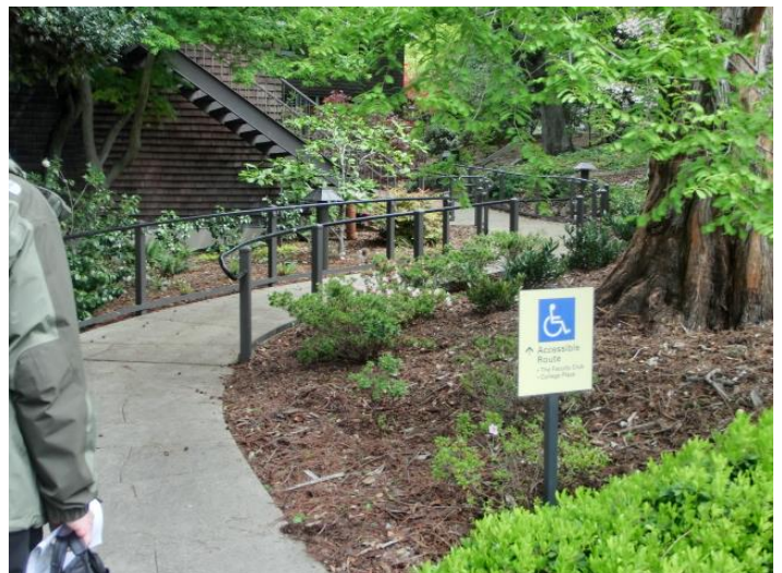
Faculty Club for professors, a serene meeting place