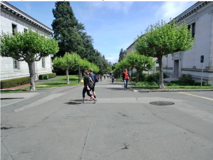
Direction Golden Gate bridge