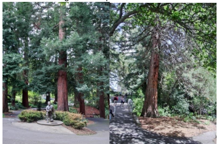
Staty av "Pappy" Waldorf (fotbollstränare)

Few serene seating places, but very nice lush