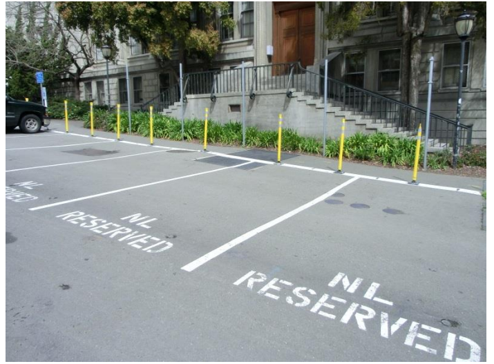
Nobel Laureates free parking the rest of their life time, The signs removed from the poles! – souvenirs?