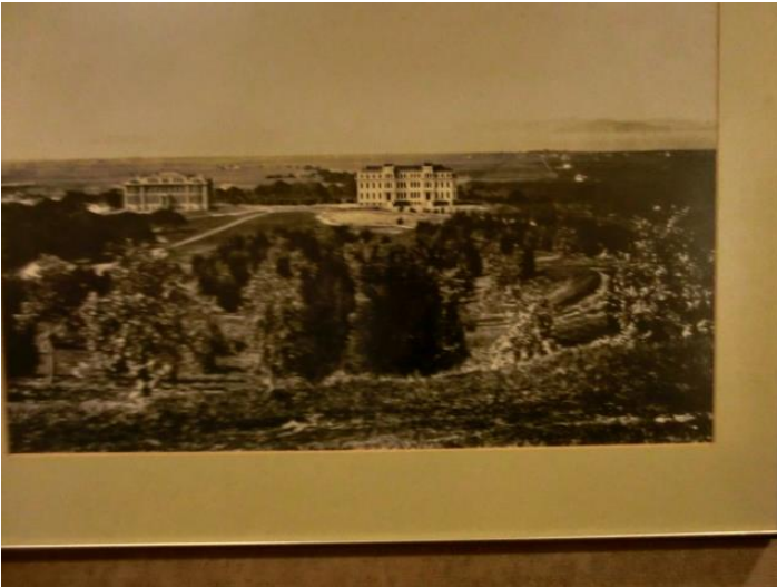
South and north Halls (1873) the start after Hall's plans. Landscape architect Law Olmsted made the first plan (1865) of Berkeley University.