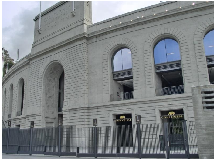
The Stadium is modern, but the facade is from 1917