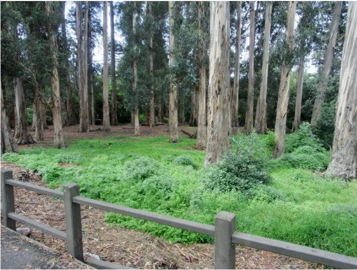
Eucalyptus Grove planted 1870