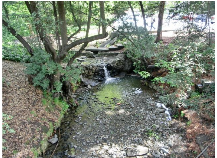
The wild is concentrated to two small creeks through the campus