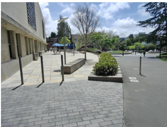
Seating often without any cozy lush