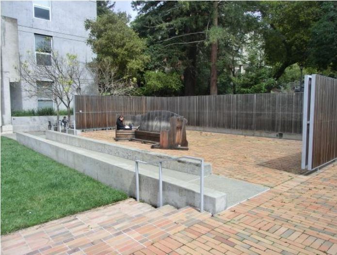
Historical bench makes a secluded place and serenity but no lush